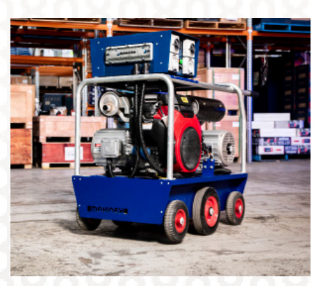
3. Power Generator 32 kW